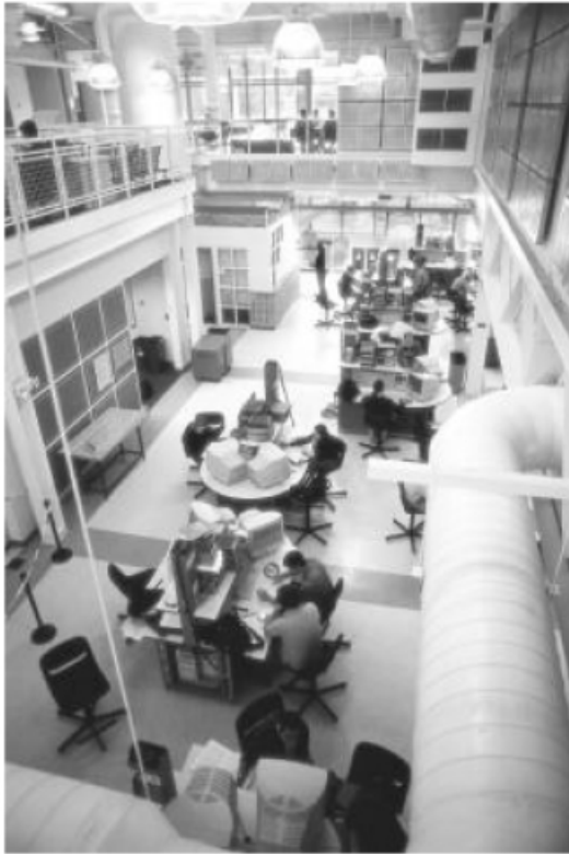
Fig. 1. One of two hands-on laboratory plazas in the ITL laboratory.

this desire with a First-Year Engineering Projects course as a counterpoint to the large, impersonal lecture classes in core mathematics and science classes [3]. In this one-semester course, which is required of some, but not all, engineering majors, students work in teams to design, build and test functioning prototypes, while honing valuable oral and written communication skills. About 14 sections serve more than 400 students annually.