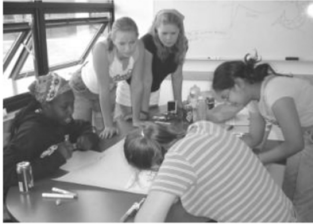
Fig. 5. High-school girls design the storyboard for their interactive multimedia presentation.

Reflecting input from the local community, SI is not just a one-time workshop, but rather a graduated series of summer opportunities for students in each of their high-school years. Open-ended design challenges pervade the curriculum for 11th- and 12th-grade students, following introductions to technology and a wide range of engineering fields in 9th and 10th grades. In a recent summer, students were challenged to design and build stereo speakers from scratch (Fig. 6). As the teens learned content theory and delved into their design/build project, they were concurrently engaged in team-building and creative-thinking activities. Hands-on engineering skills were developed, as they used digital cameras and color scanners and participated in soldering, hand tools, machining and software mini-workshops.