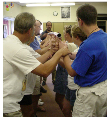
Teachers work together to solve an engineering challenge.