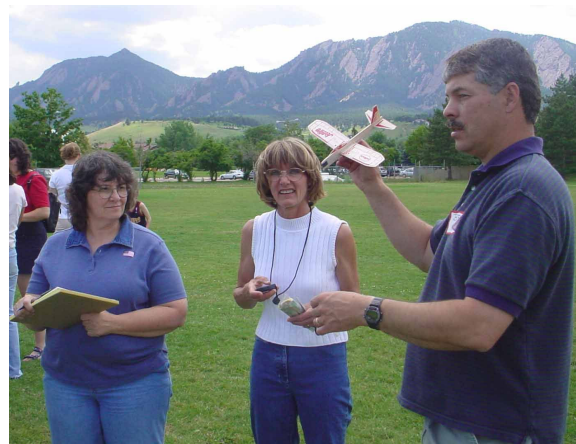
"Up, Up and Away" participant teachers explore drag, thrust and lift as they relate to flight.

Day one of the workshop focused on curricular components of lesson plans and engineering content. In later workshops, teambuilding and engineering design (with reflection on each) were added. Engineering faculty experts helped teachers delve into the curricular content by leading content lectures and hands-on activities related to the topic. Workshops also addressed current trends in assessment, both in classroom and in educational research. Late in day one, teachers split into same-grade level pairs to become familiar with the contents of a specific lesson from the curricular unit.