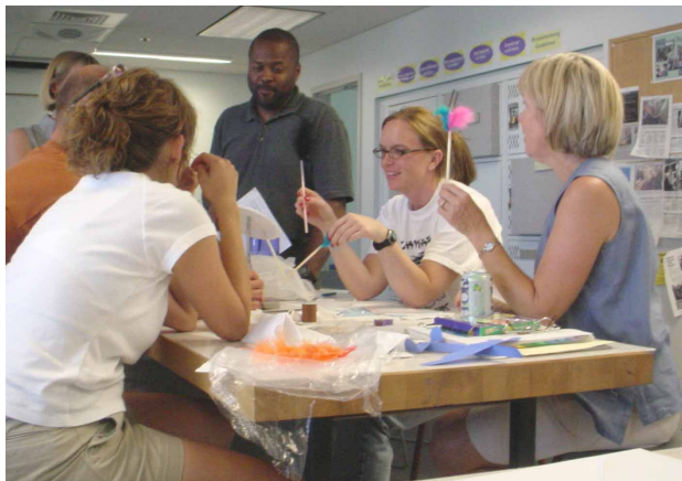
Teachers brainstorm designs for making airplanes out of straws and construction paper.

Teachers are bombarded with the latest theories of how students will best learn in their classroom. And yet, a disconnect exists for teachers between what is pedagogically the trend and what can actually be accomplished in the classroom [1]. Often, teacher professional development experiences are deemed "too theoretical" and not practically applied to what actually goes on in the classroom. Investigations indicate that learning experiences, for teachers as well as students, need to be modeled within appropriate contexts. A hands-on, experiential approach offers a valuable, real-life instructional method for learning science, especially when it imitates authentic science practice [2]. This also applies to technological literacy. Unfortunately, too few people actually possess enough hands-on technological experience to render them highly knowledgeable from a technological perspective. Greater technological literacy may be directly influenced by one's academic experiences, especially in elementary and secondary school [3]. In an increasingly technologically-driven world, improved technological literacy is beneficial to society so that all citizens can make informed decisions. Therefore, educators must play an