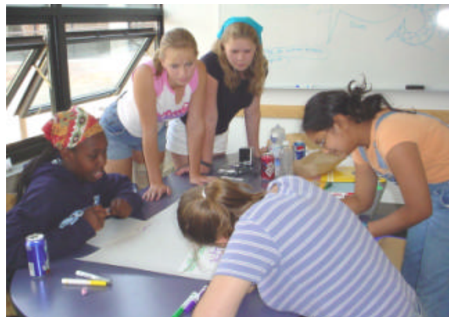
Figure 5. High school girls design the storyboard

Thirty-six high school girls explore their potential for a career in engineering and technology through developing educational interactive multimedia software during a six-week Girls Embrace Technology summer internship. [9] The intent is to help girls get past social and stereotype hurdles so they can envision themselves in an engineering or technology career. “Techno-neutral” girls are targeted — those who do not envision themselves pursuing a career in high-tech, yet have the academic preparedness, curiosity and commitment to complete the internship and produce a successful multimedia product. The girls are paid a nominal $50 per week stipend and work in four-person teams to create multimedia educational software to teach elementary or middle school children basic science principles. The interns develop technical skills in