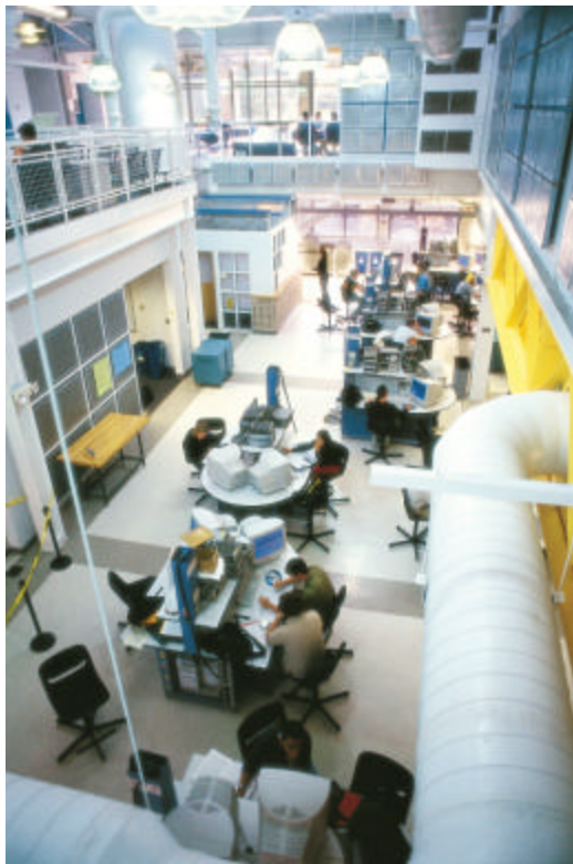
Figure 1. One of two hands-on laboratory plazas in the ITL Laboratory.

The physical home for the ITL Program is the ITL Laboratory, a learning environment designed to support team-oriented, hands-on learning across all engineering disciplines. [1] The facility features team study rooms, design studios, large shared laboratory plazas with powerful data acquisition and analysis capability (Figure 1), and an active learning center. An excellent technical staff helps students create what they dream, particularly in the two fabrication centers. The Electronics Center allows students to simulate, design, prototype and test electronic circuits. The Manufacturing Center features CNC and conventional machine tools, CNC laser cutters and a “3D printer” rapid prototyping system for creating physical prototypes directly from CAD models.